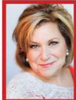
Sandi Patty's Electrifying Rendition of God Bless America