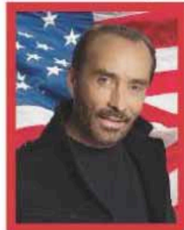
Lee Greenwood Music Icon & Sacramento native will lead us in The Pledge